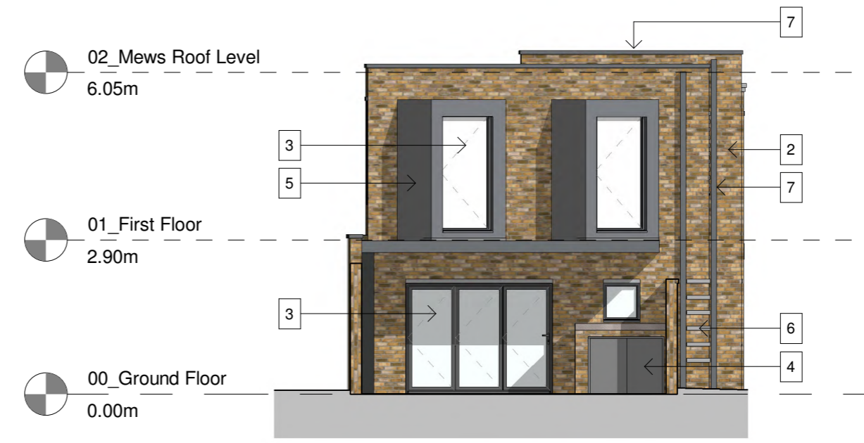
Mews Elevation 2 1 : 100